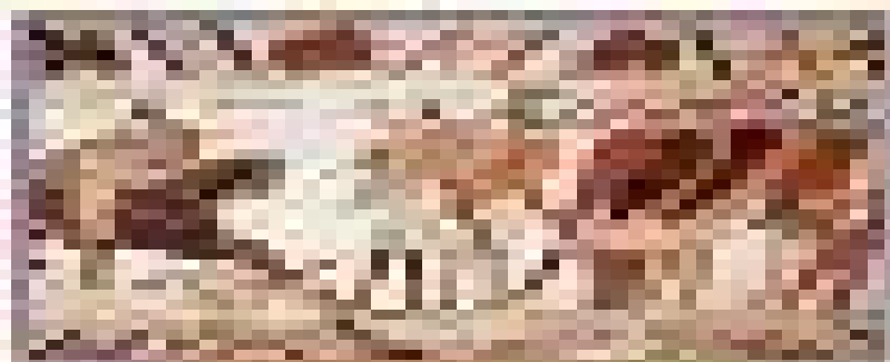
The Tomb of Richard I, King of England