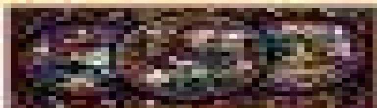
The Tomb of Richard I, King of England