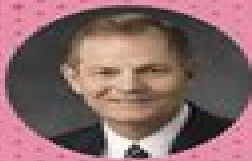
By Elder Gary E. Stevenson Of the Quorum of the Twelve Apostles