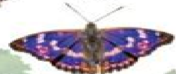
Purple Emperor Butterfly