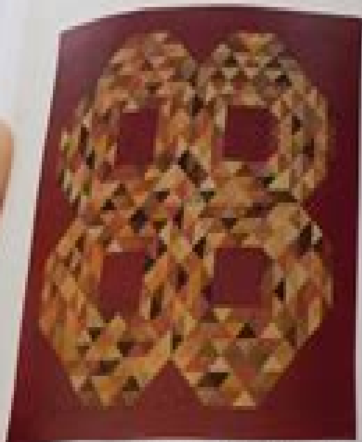
PLATE 19. Green Waves , circa 1870. Pennsylvania. unknown. 11' \times 11'10'' . Cotton. Collection of Gloria Lutz. Photograph.