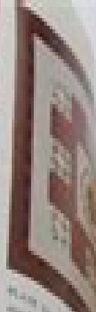
PLATE 17. Lefferts Star , circa 1840s. Pennsylvania. unknown. 11' \times 10'10'' . Cotton. Collection of Gloria Lutz. Photograph.