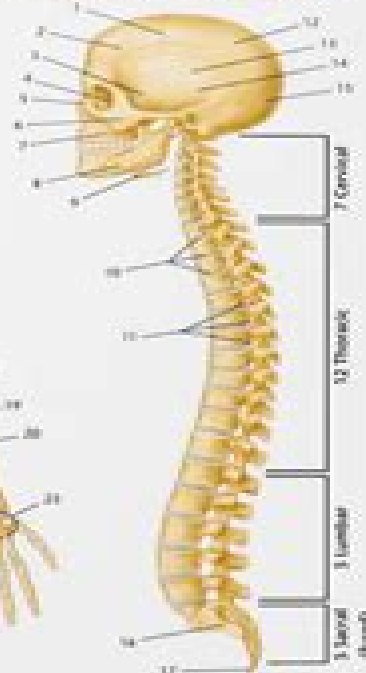
Figure 2: Skull & Vertebral Column (Lateral View)