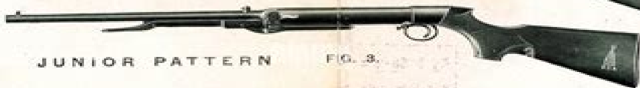
JUNIOR PATTERN FIG. 3.