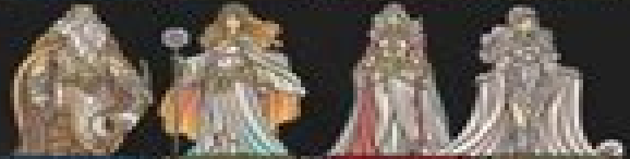
MORANA LADA ZORYA KORYMBOS