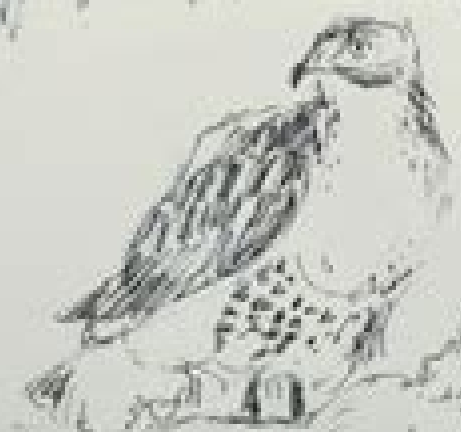
The hawk stayed by the hill. Stopped to take prey and she called out. This bird later she was still there.