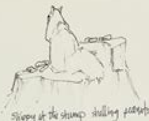
Stumpy at the stump - skulking predators