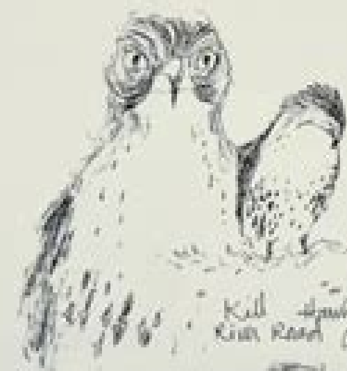
Kill - stump near SEA River Road - Chesham