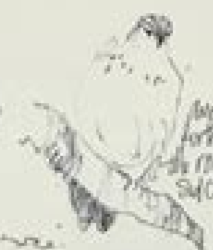
Another hawk for the area the road Sul Chant PARK