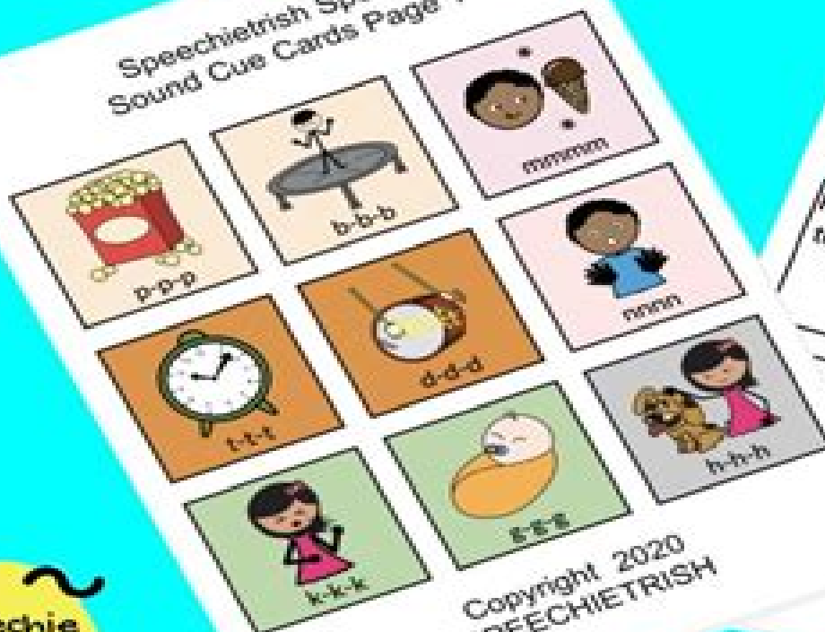
Speechietrish Speech Sound Cue Cards Page 1