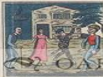
Repetition of the Old Appearance of each other.