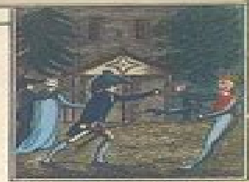
Entrance of Vauxhall Gardens.