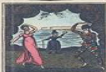
Mother Goose passing the Egg into the Pool.