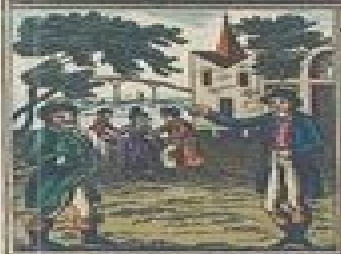
Mother Goose followed by others.