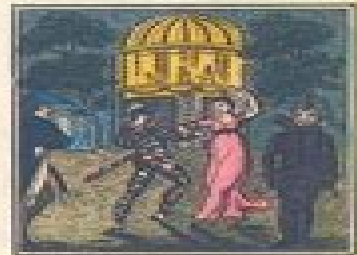
Interior of Vauxhall.