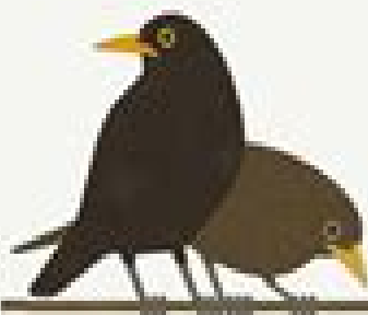
Amsel Turdus merula