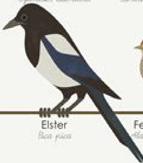
Elster Corvus frax