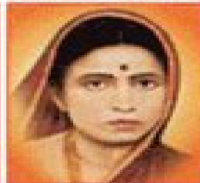
रामबाई अंबेडकर Ramabai Ambedkar