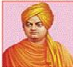
स्वामी विवेकानंद Swami Vivekanand