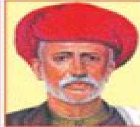
महात्मा ज्योतीबा फुले Mahatma Jyotiba Phule