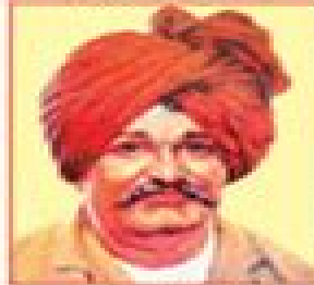
राजशी शाहु महाराज Rajshi Shahu Maharaj