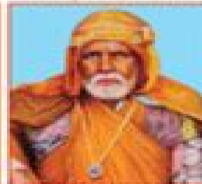
संत श्री गडगे बाबा Sant Shri Gadga Baba