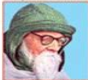
आचार्य विनोबा भावे Acharya Vinoba Bhave