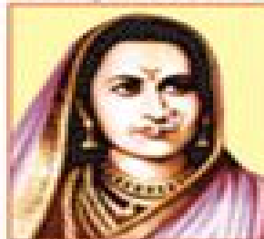
राजमाता जिजाबाई Rajmata Jijabai