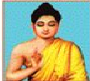
भगवान गौंगारं बूड Bhagwan Gauranga Bude