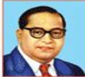
डॉ. बी. ए. अंबेडकर Dr. B.R. Ambedkar