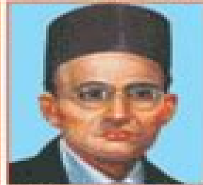
विनायक दामोदर सावरकर Vinayak Damodar Savarkar