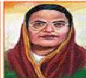
रामबाई रानडे Ramabai Ranade