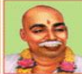
राष्ट्रवंत श्री तुकडोजी महाराज Rasthreevant Tukdoji Maharaj