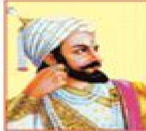
छत्रपती शिवाजी महाराज Chhatrapati Shivaji Maharaj