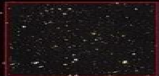
The Hubble Image of a small region of the observable universe.

The universe has both gravity and antigravity matters in 3-dimensional space!