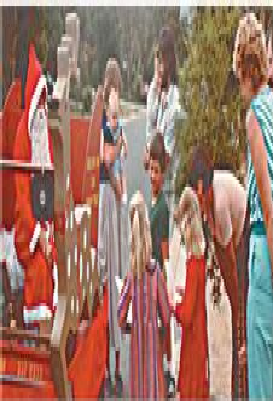
The Christmas sleigh visiting the streets of Atholstone